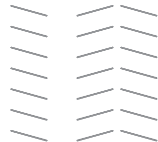
Accident Diagram 2 (Parking Lot)